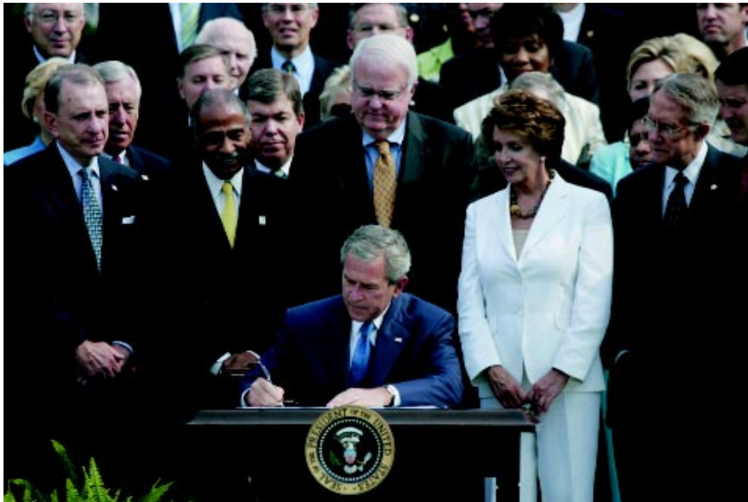
President Bush signs the 2006 Voting Rights Extension Bill